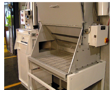
Connected to Bag Dump Station